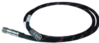
VideoMATES® 75 Ohm Coax & Triax