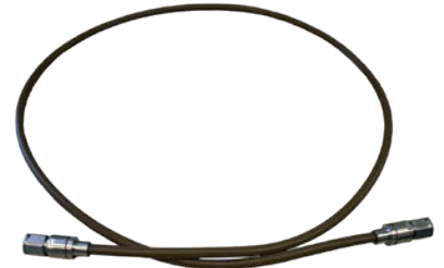
MicroMATES® Ku Band & X Band