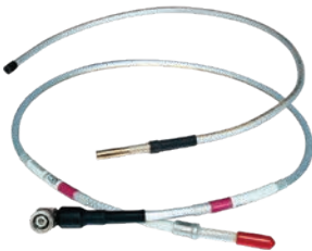
RFMATES® 50 Ohm Coax & Triax

For over 45 years, PIC Wire & Cable has been a global provider of electronic cables, cable connectors and cable assemblies for demanding military, corporate and commercial applications that include airplanes, helicopters, ground vehicles, rail transport and marine vessels. PIC cables, connectors and cable assemblies are widely specified for use in major aerospace and military systems throughout the world.