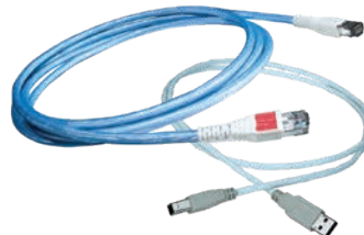
DataMATES® Ethernet High Speed Data/USB